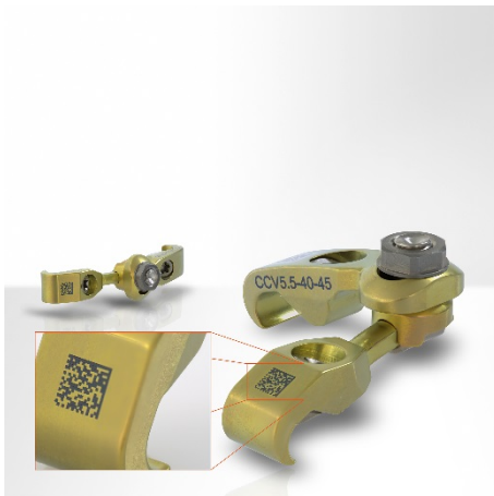
Laser marked Interbody connector for spinal fusion surgeries