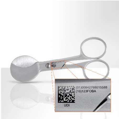
UDI-marking on stainless steel umbilical cord scissors