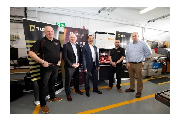
The FOBA M2000 marking workstation at Technological University of the Shannon (TUS).

https://www.fobalaser.com/newsroom-events/news-press/collaboration-between-dmg-mori-and-foba/